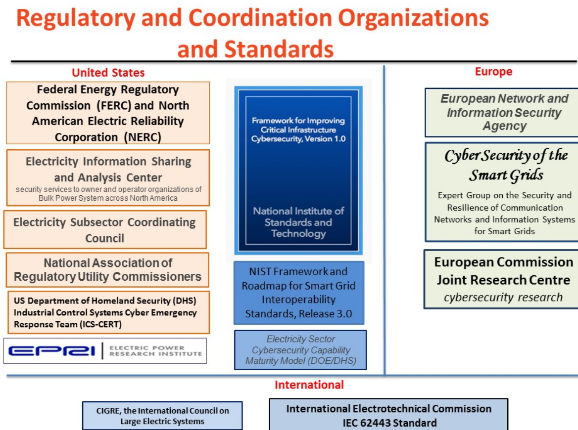
Figure 3: Organizations Involved in Cybersecurity for Electric Utilities in the US and Europe

A summary of electric utility regulatory organizations, electric utility coordinating organizations with a role in cybersecurity and resiliency, and relevant standards for different parts of the world are found in this document and Figure 3. (Note: Figure 3 visually presents U.S. organizations on the left, European organizations on the right, and international organizations on the bottom; there are no flows shown or order to the placement of the organizations.)